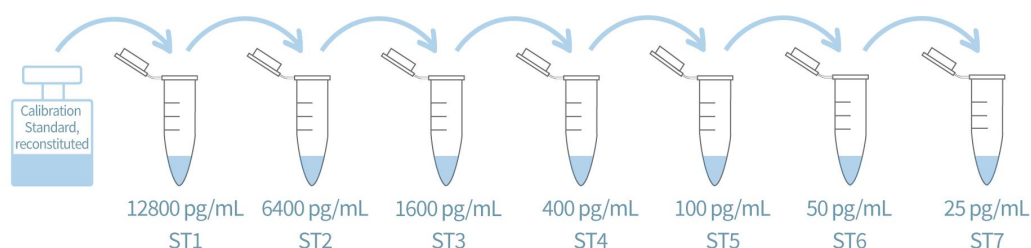
Figure 3. Graphic scheme of CHO PLBL-2 Calibration Standard Solutions